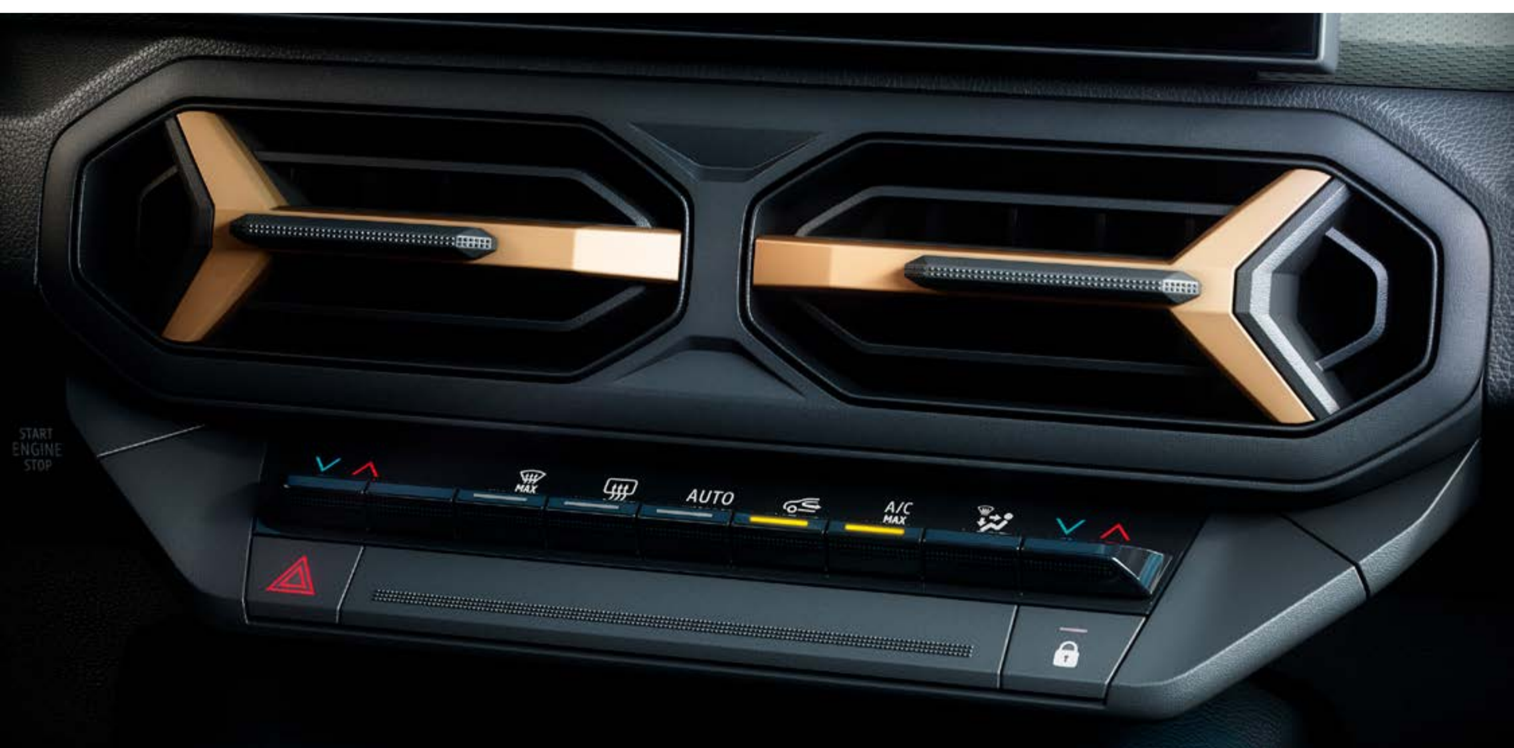
Dual Zone automatic air conditioning

Designed for the pleasure of five passengers, the interior ambience features controlled soundproofing, an Arkamys® 3D sound system with six speakers and customisable dual-zone air conditioning in the front and with the rear air vents.