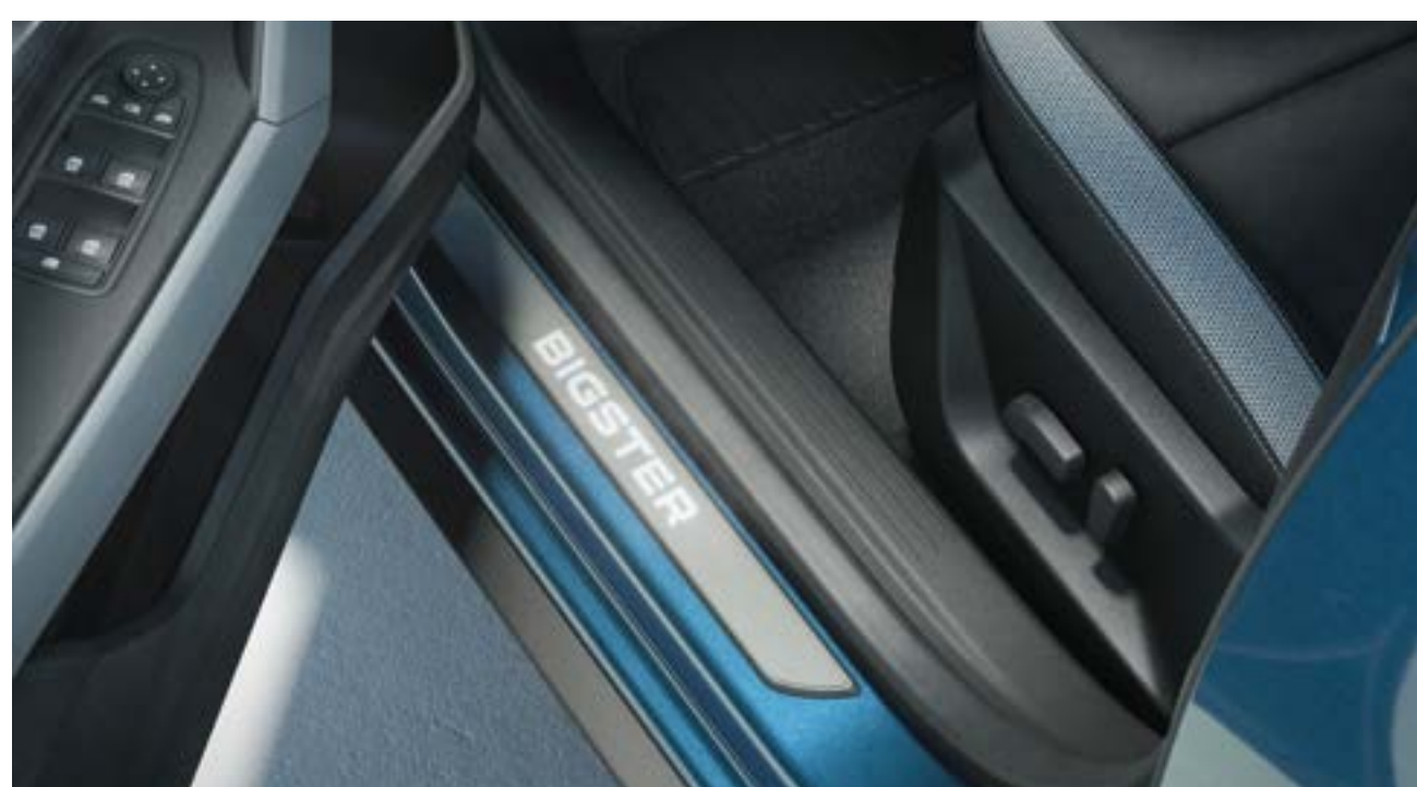
Illuminated door sills