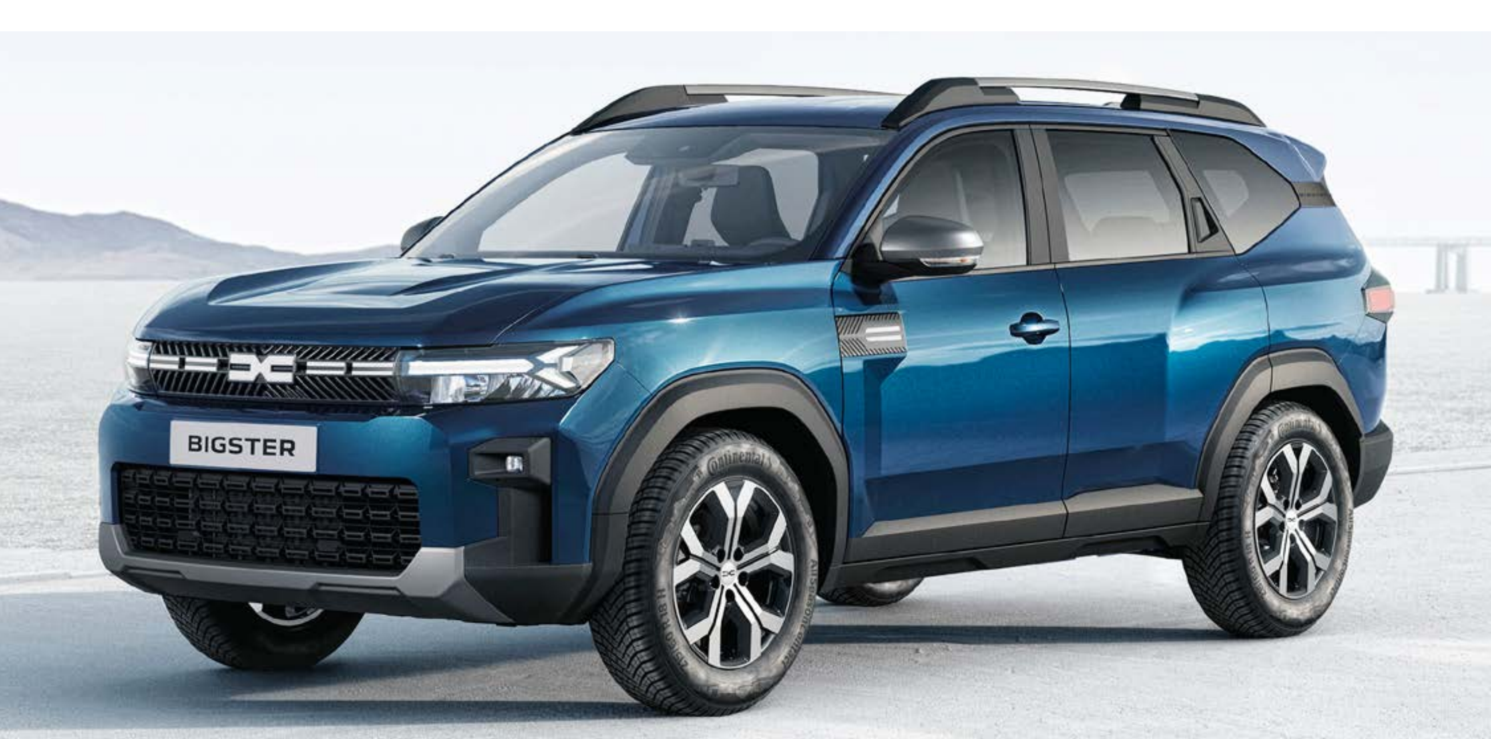
INDIGO BLUE (2)(3)