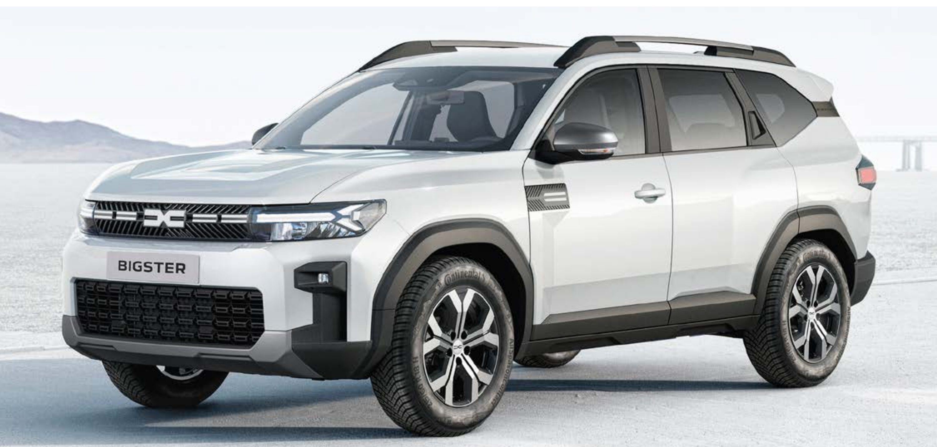
GLACIER WHITE (1)