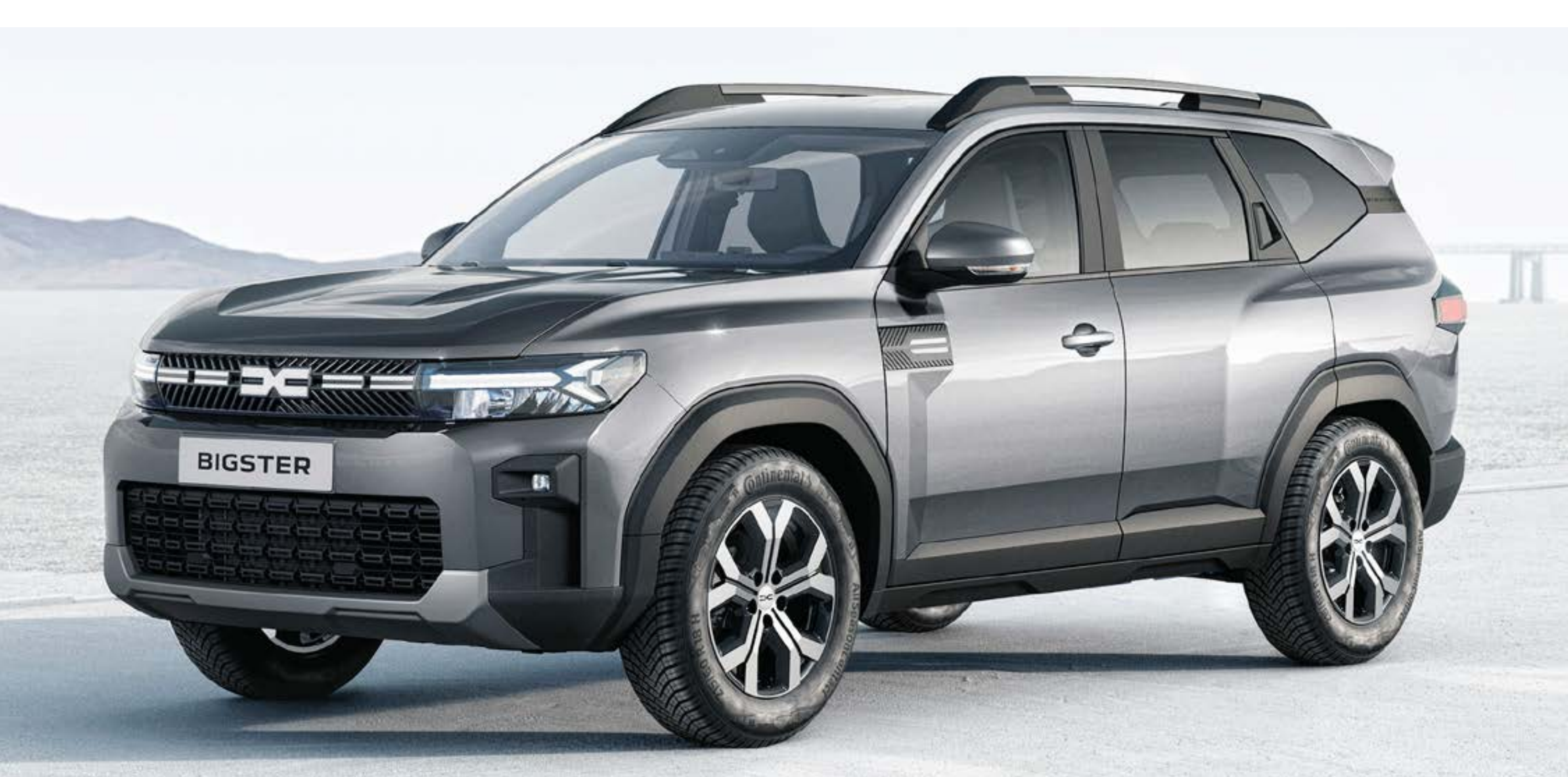
SHADOW GREY (2)(3)