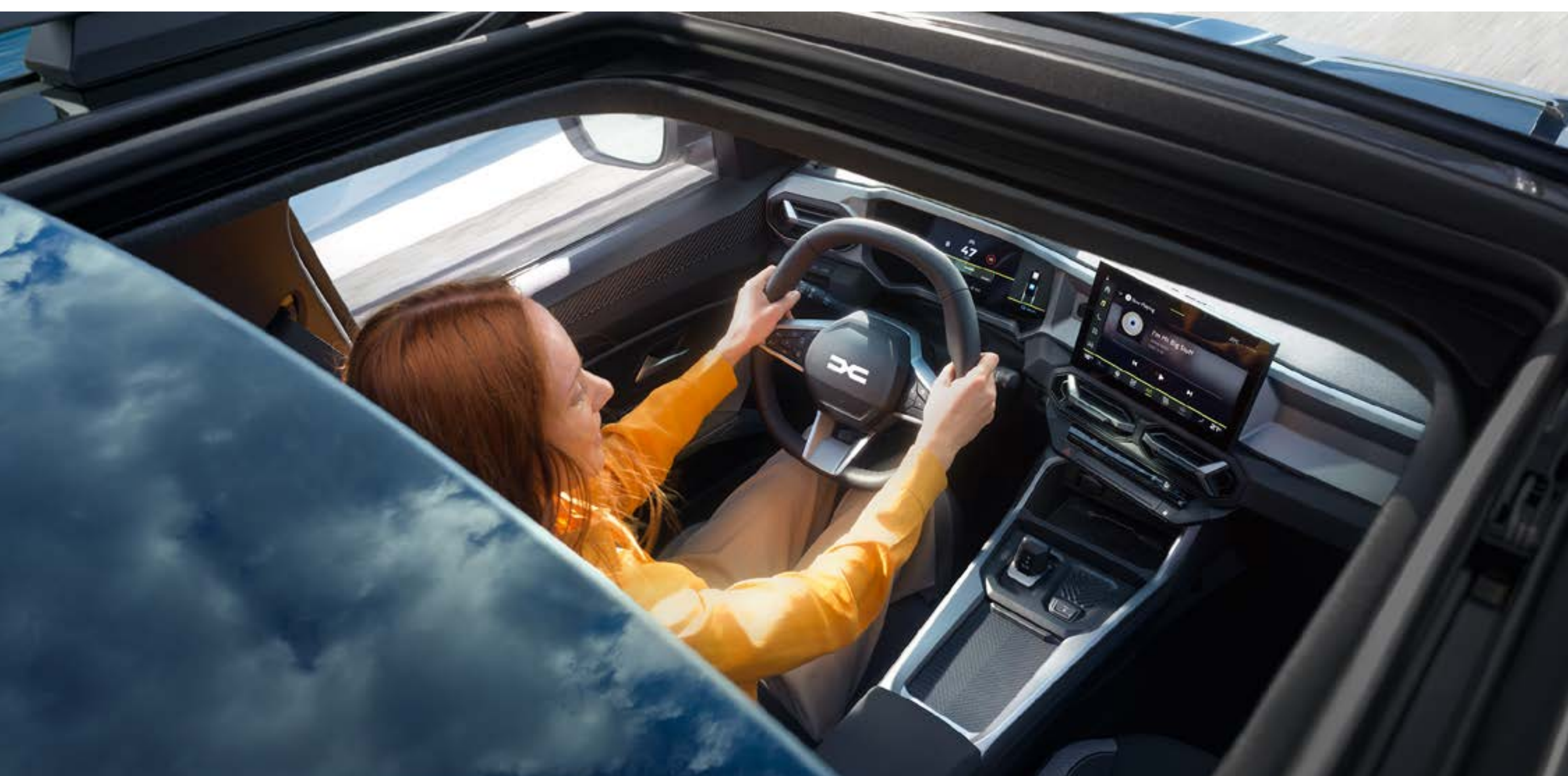
Panoramic opening sunroof (2)

Featuring a panoramic opening sunroof (1) providing unique interior light, its exclusive Indigo Blue exterior colour adds an additional touch of distinction. There's a Bigster for everyone.