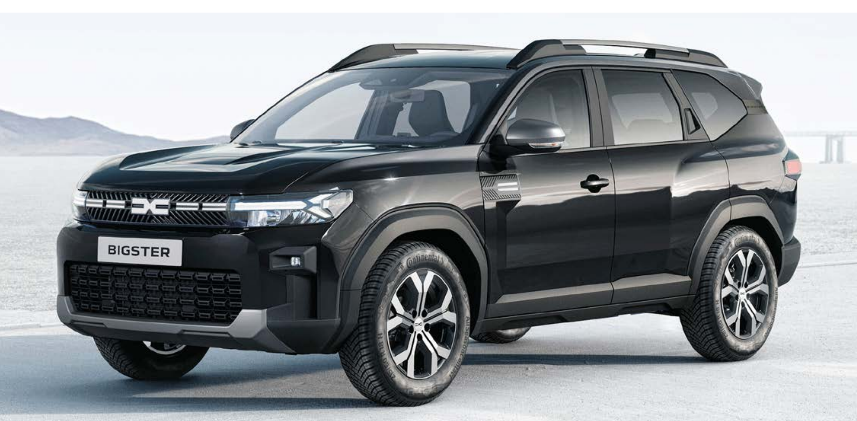
PEARL BLACK (2)