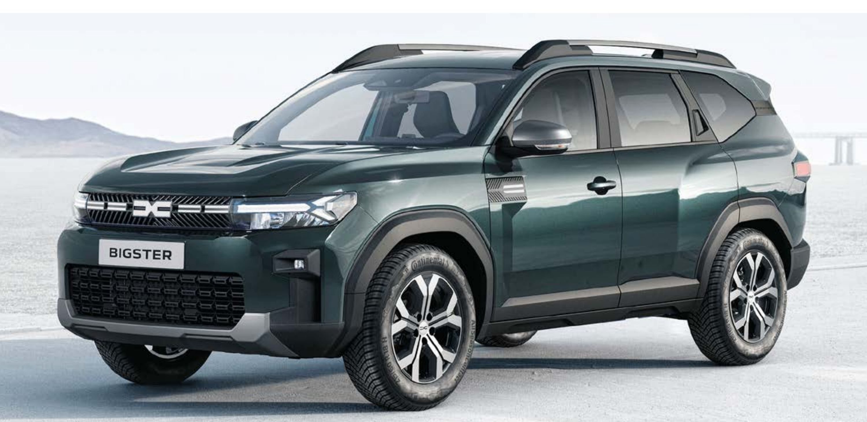
CEDAR GREEN (2)