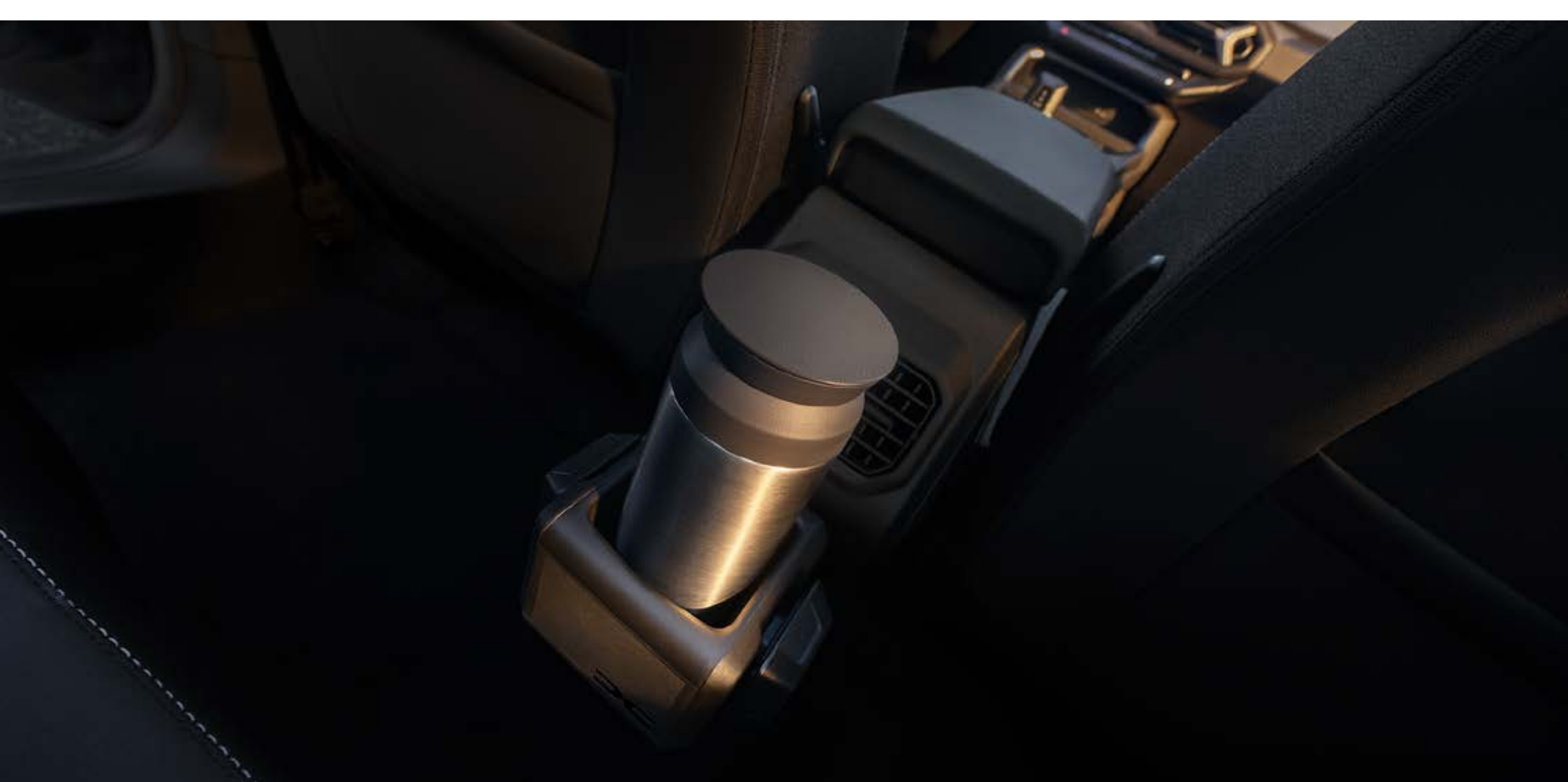
3-in-1 YouClip (2)