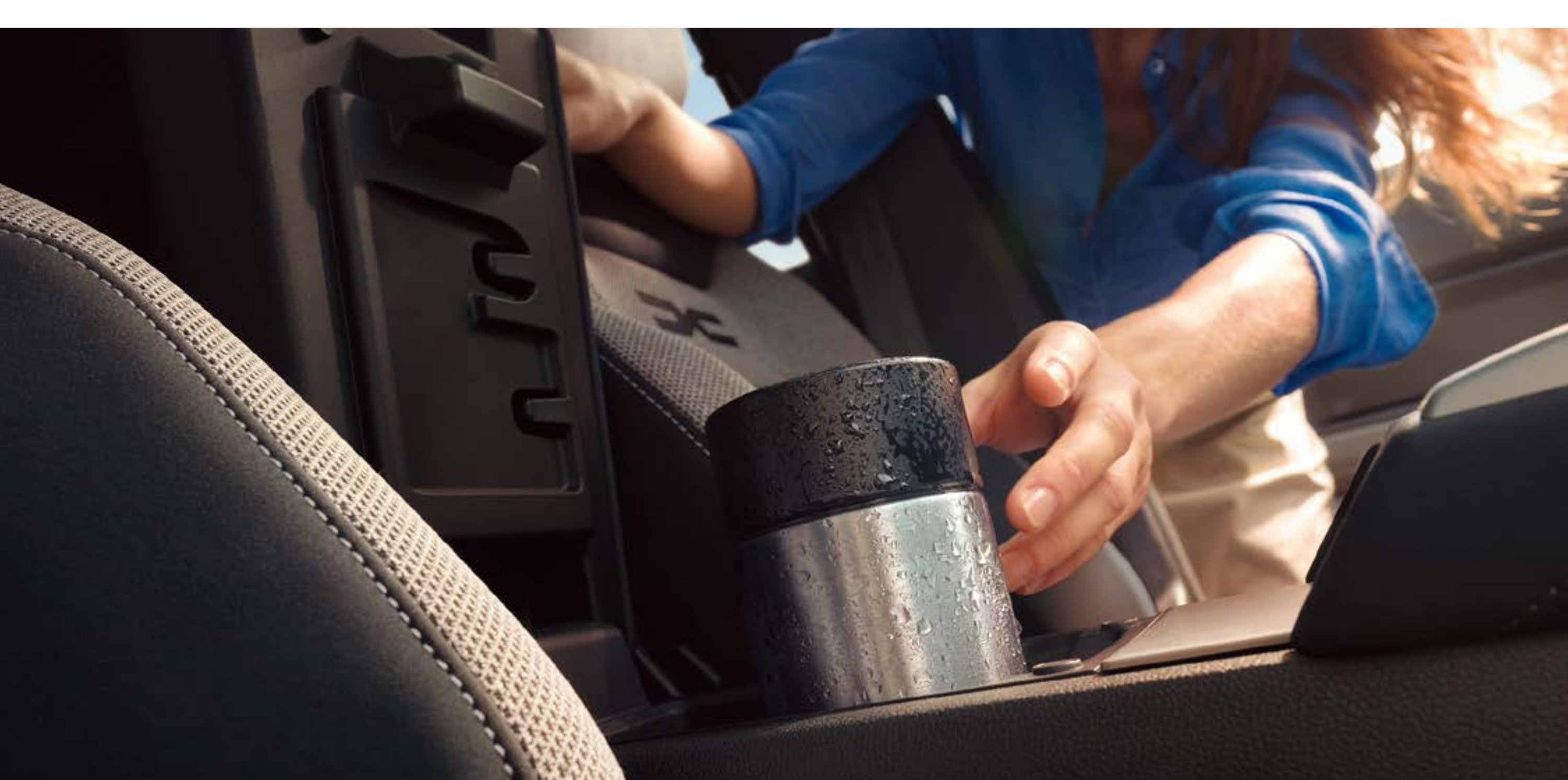
High console with cooling storage (1)

And try out the ingenious YouClip attachment system: four fixation points distributed throughout the vehicle, with the option to add two additional points with the headrest support as an accessory. Use it to securely hang all your various items (phone, tablet, cup, etc.).