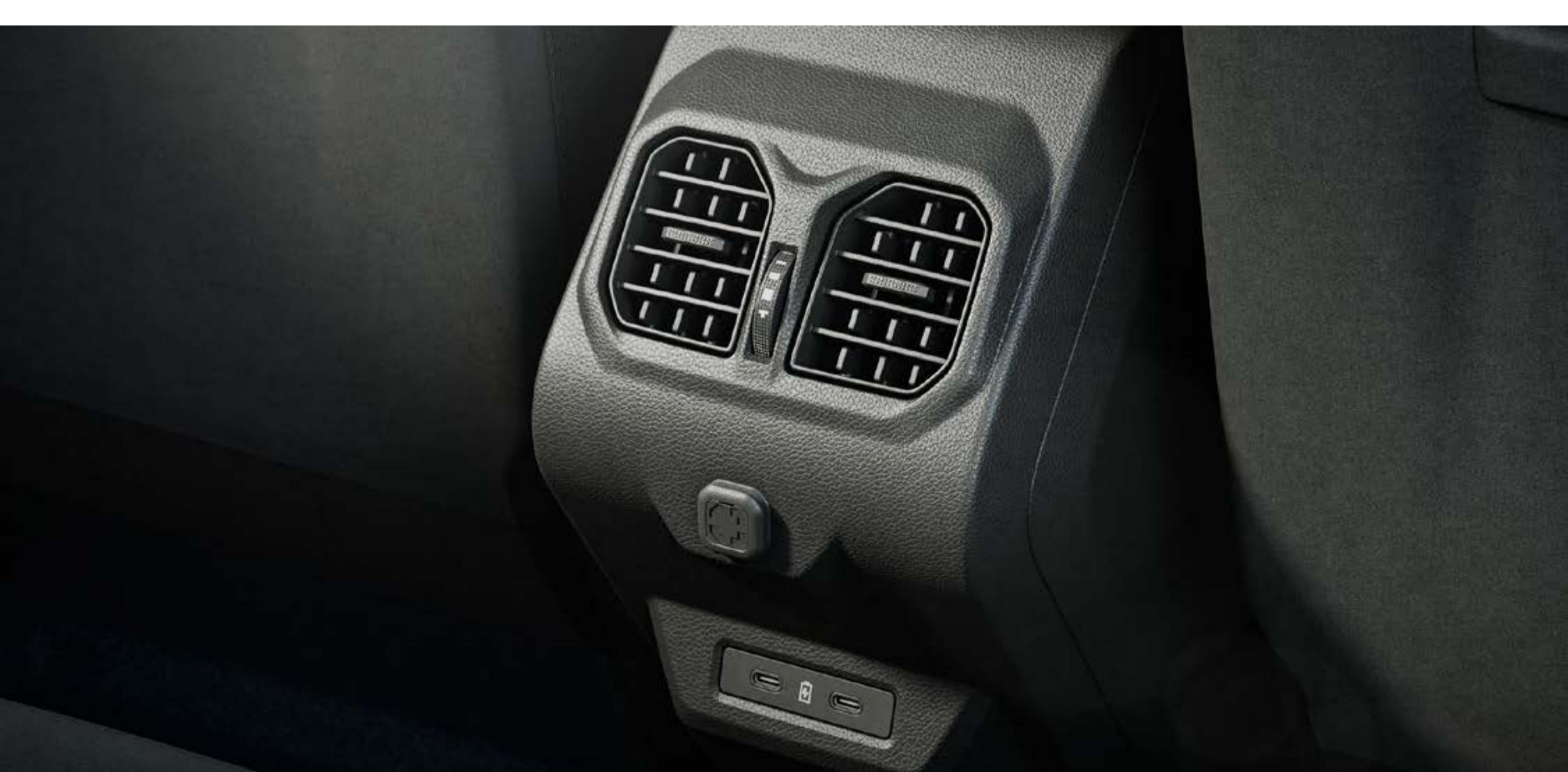
Rear air vents