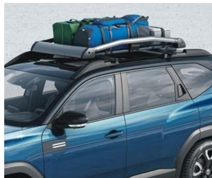
Cargo roof rack