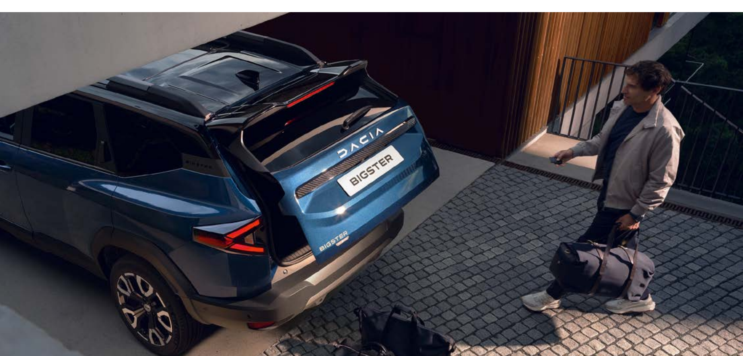
Powered tailgate (3)